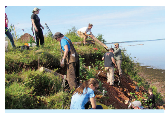
Staff and volunteers work with a watershed group

"Volunteers do a lot of stream cleaning to make a better environment for fish and groundwater. We do education and outreach, such as hosting events and