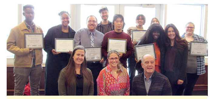
2024 PEI Essential Employability Skills Project graduates. Front row are staff members.

PEI Essential Employability Skills (EES) Project, administered through PEI Literacy Alliance, is a 12-week program including six weeks in the classroom and six weeks on the job.