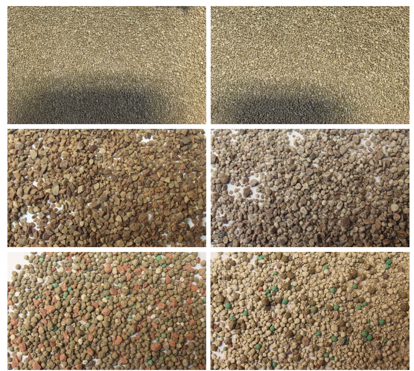
Figure 2: Images of agrochemicals before and after cycling; Casoron G-4 before (top left), Casoron G-4 after (top right), clay filler before (middle left), clay filler after (middle right), fertilizer before (bottom left) and fertilizer after (bottom right)

The clay filler saw the greatest increase in bulk density across all granules with a mean difference of 13.34 g 100mL<sup>-1</sup> between the before and after samples. This data is in accordance with the particle size data which saw an average reduction of 0.721 mm between the before and after cycling samples of clay filler.